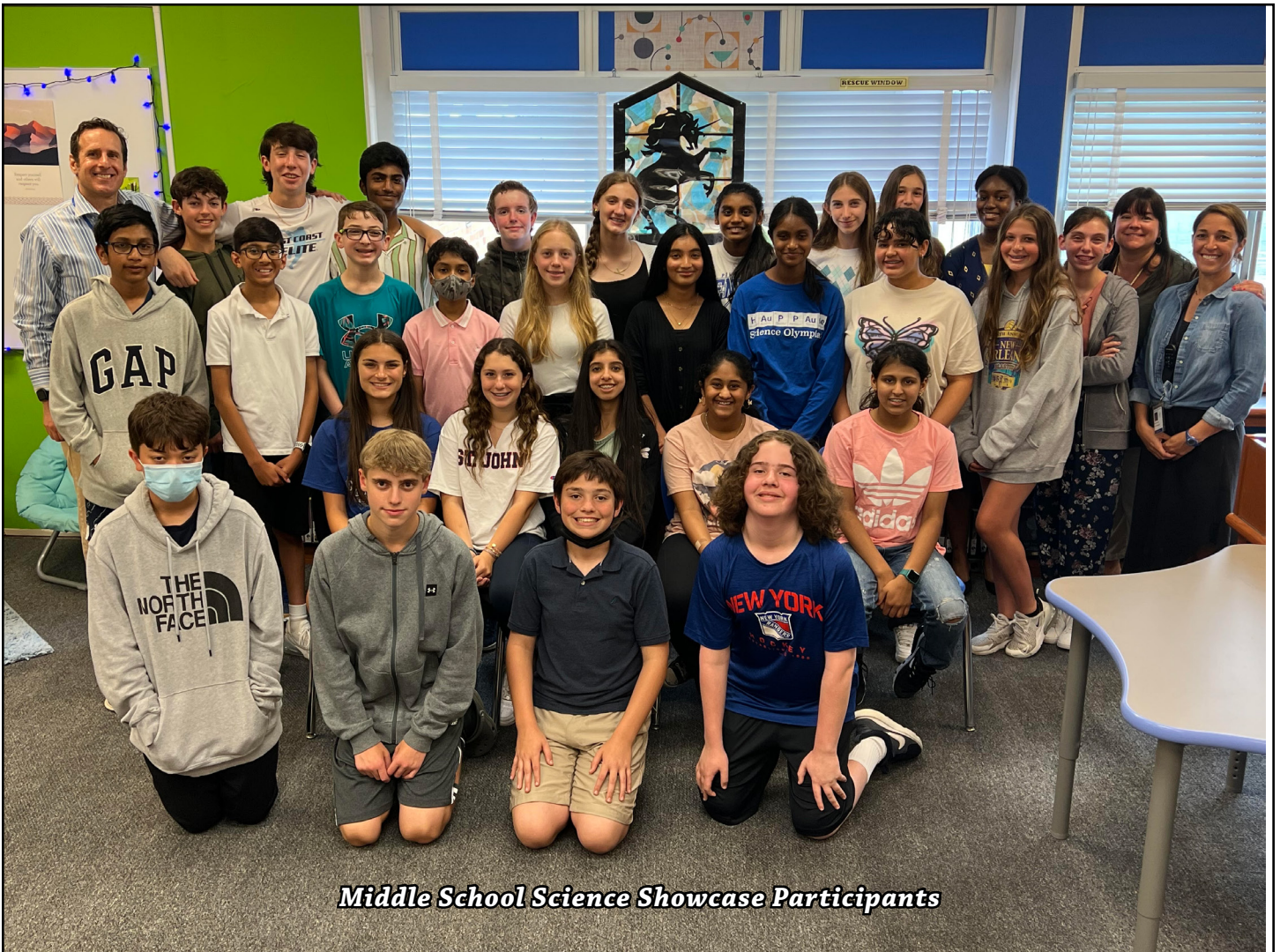
Middle School Science Showcase Participants

Below is a great photo of our Middle School “Science Eagles!”